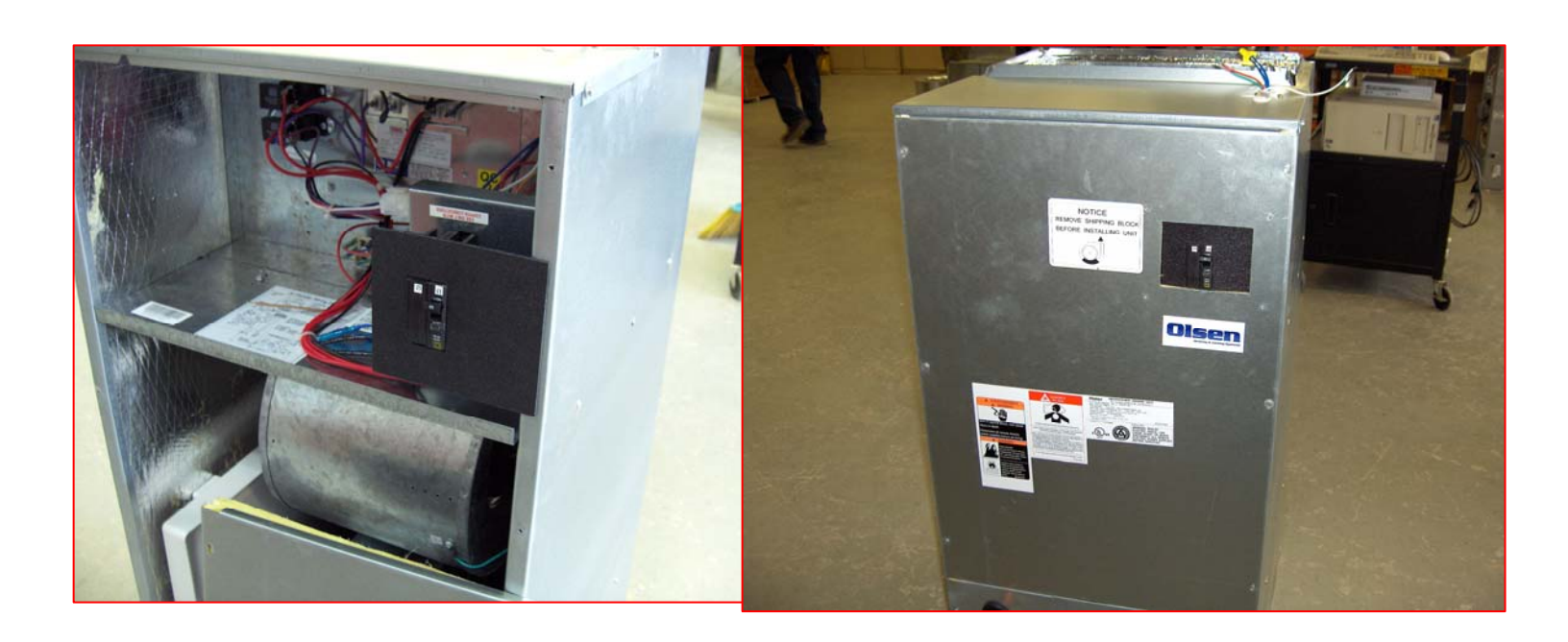
Page 2 of 3

3. Install the breakers, connect power to the breakers and install the front door.