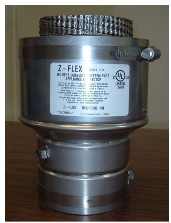
Figure 2. Z-Flex Appliance Adaptor (shipped with furnace)